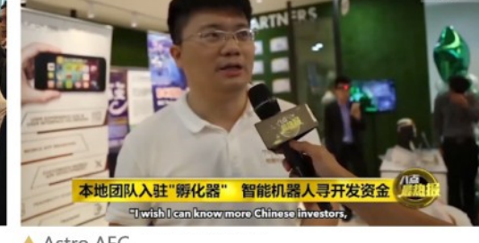
🔺 Astro AEC